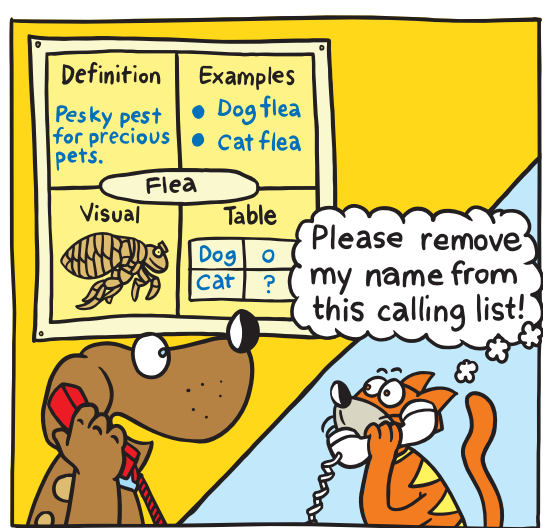
"I'm taking a survey for my four square. How many fleas do you have?"